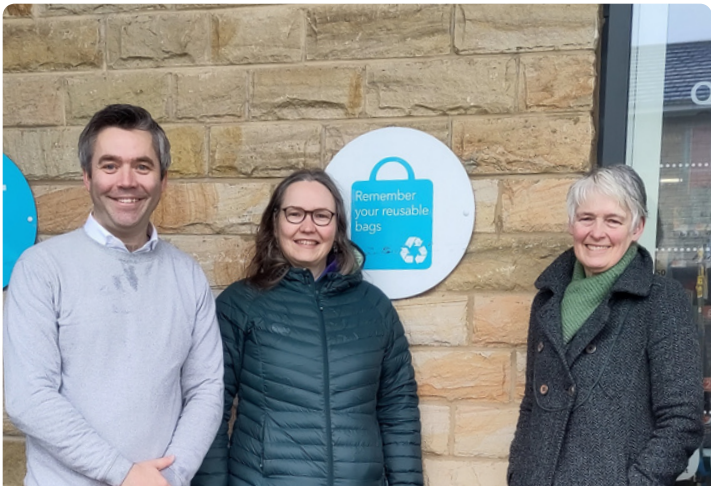
Bulk ward's Green councillors are campaigning for a new postbox at the Co-op on Quernmore Road