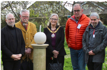
Members of the Storey Gardens team with Lancaster's former mayor and the new stone Czar plum