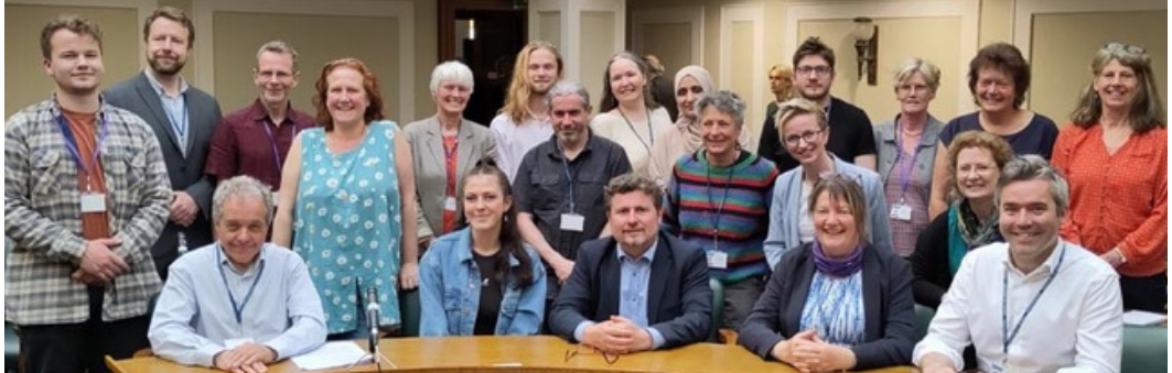
The new group of 21 Green City Councillors at their first Full Council meeting in May