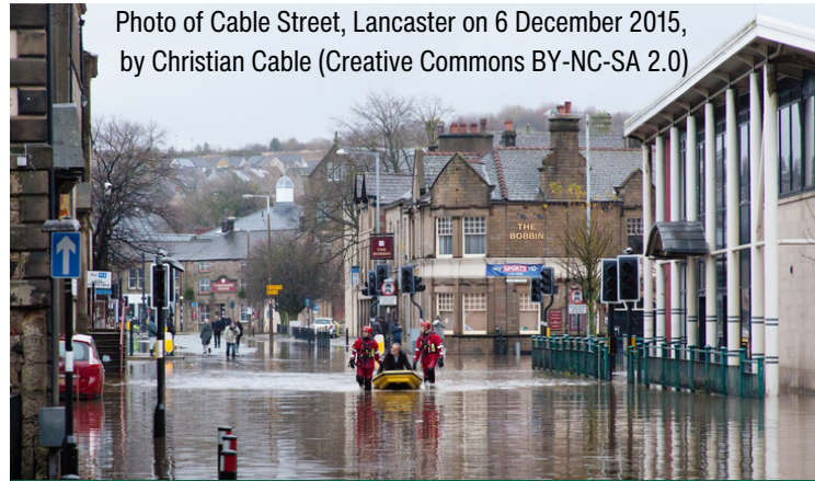
Photo of Cable Street, Lancaster on 6 December 2015, by Christian Cable (Creative Commons BY-NC-SA 2.0)

The long-awaited County report will be published this summer.