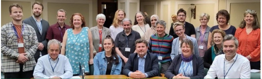
The new group of 21 Green City Councillors at their first Full Council meeting in May