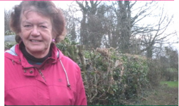
Cllr Sue wants to hear your ideas for the land off The Roods

“Making better use of the land might include some orchard planting and wildflower areas, with the possibility of some refurbished play equipment. If you are interested in developing ideas for this land, helping with fundraising and/or planting please contact me before 1st March.”