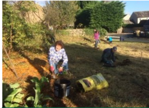
Cllr Sue getting stuck in with planting flowers and seeds on the Village Green

"It is good to see these areas being filled with wildflowers and fruit trees."