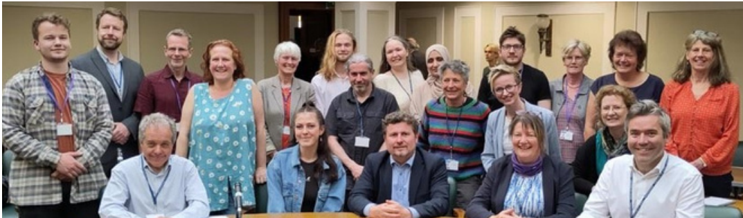
The new group of 21 Green City Councillors at their first Full Council meeting in May