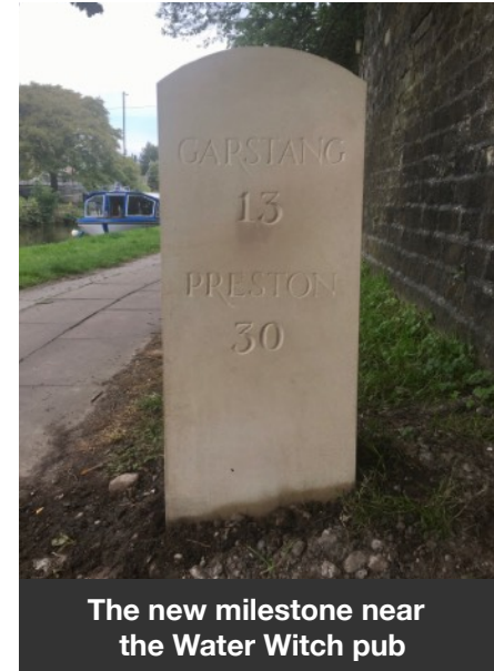
The new milestone near the Water Witch pub

Historically the milestones were used to calculate toll charges based on the distance travelled, so face the opposite way to what might be expected.