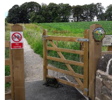
Path from Aldcliffe Road

Fairfield Nature Reserve has created a new footpath around Pony Wood, extending local walking opportunities and giving great views of the reserve, the castle and on good days, the Lake District. Dog walkers are kindly requested to keep dogs on leads.