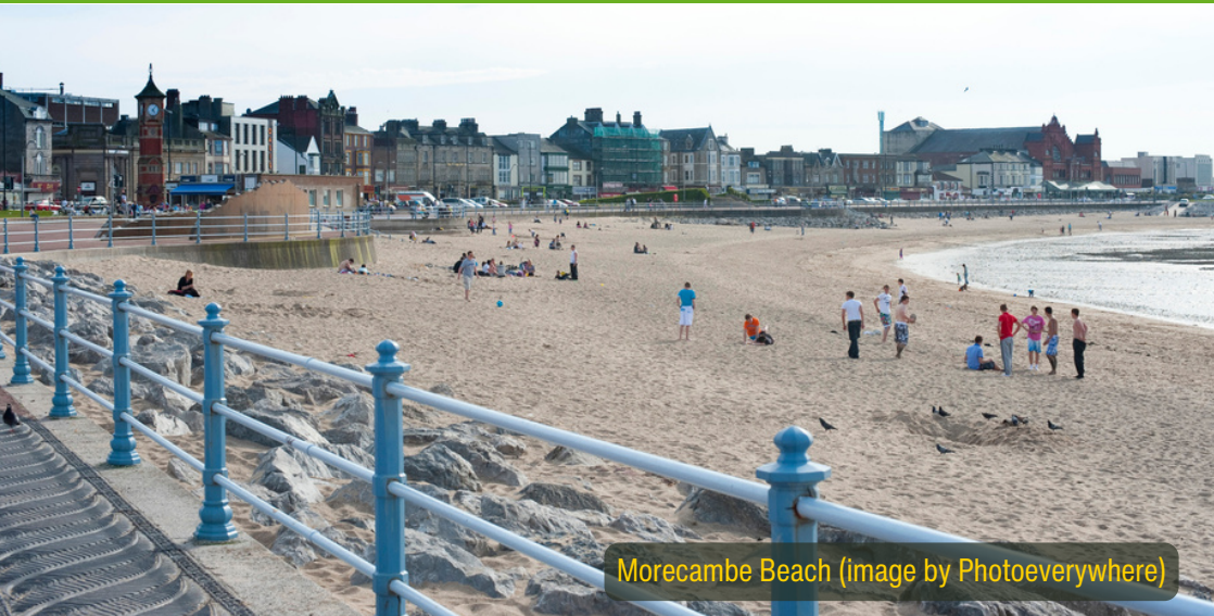
Morecambe Beach