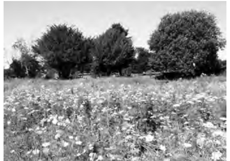
Summer wildflowers in the park